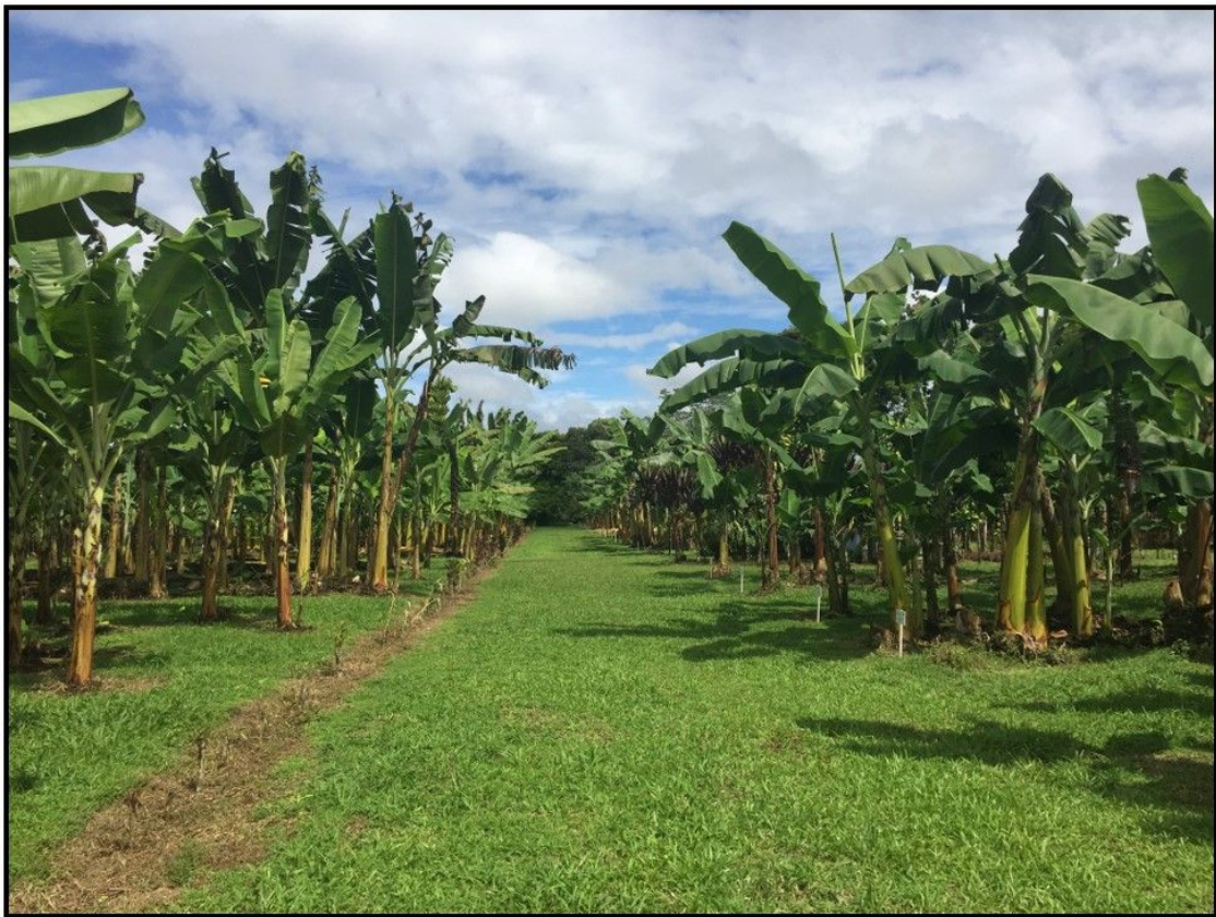
The CORBANA field collection, Guápiles, Costa Rica

MusaNet Latin American and Caribbean regional workshop at CORBANA